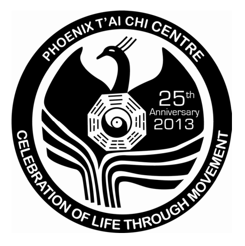
Celebration of Life Through Movement

Offering instruction and guidance in T'ai Chi and Qigong