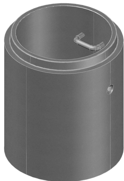
ISOMETRIC VIEW NTS