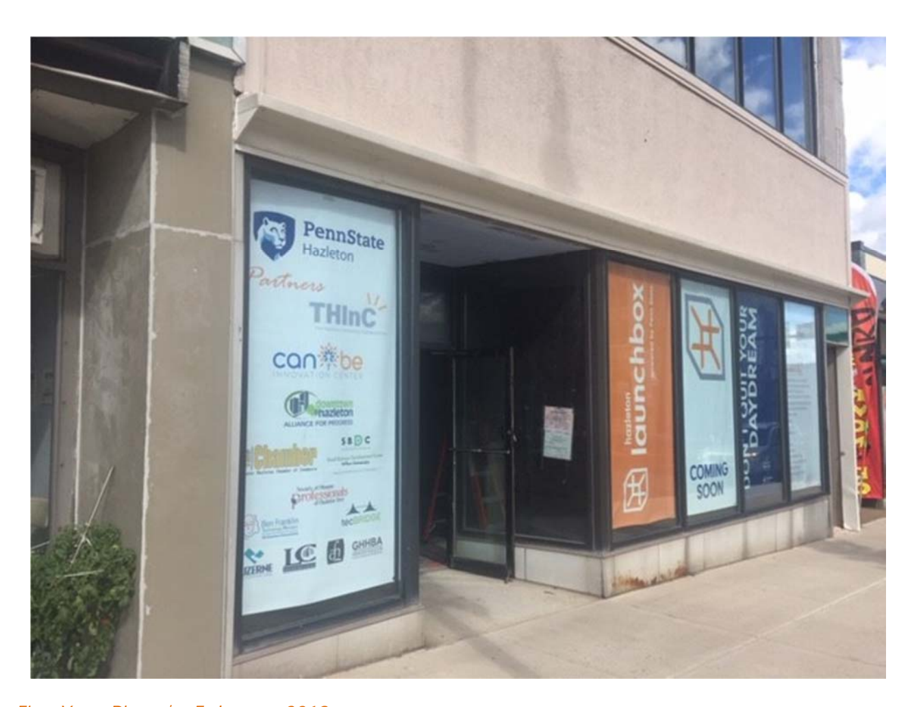
Five Year Plan | February 2019