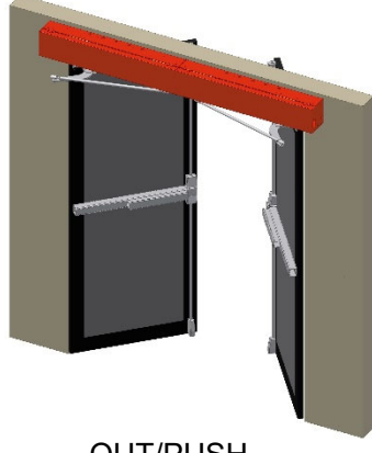
OUT/PUSH (doors swing away from Operators)