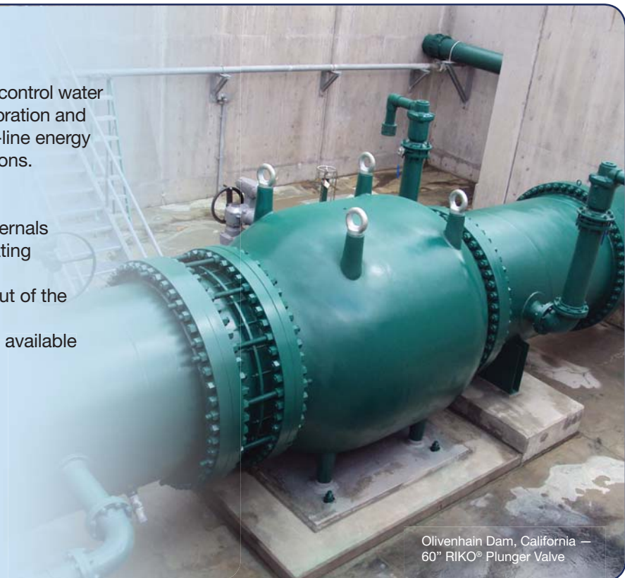
Olivenhain Dam, California — 60" RIKO® Plunger Valve