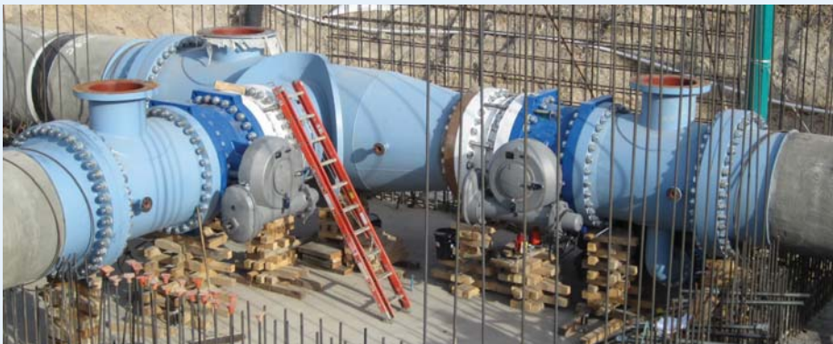
Two 48" EKN® Butterfly Valves — shown here being installed on the North Shore Aqueduct in Utah — help to safely modulate and control gravity flow in the aqueduct system.

Owner: The Central Utah Water Conservancy District (CUWCD)