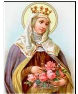
Feast Day November 17

One of her greatest known miracles occurred when she was still alive: the miracle of roses. It is said that during one of her trips delivering bread to the poor in secret, Louis met with her and asked her questions to erase everyone's suspicions that she was stealing treasures from the castle. He asked her to reveal the contents under her cloak, and as she did a vision of white and red roses was seen. St. Elizabeth was canonized in 1235. She is the patron saint of Catholic Charities, bakers, beggars, brides, homeless people and widows.