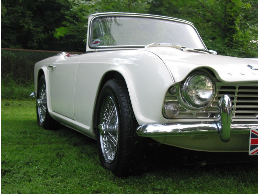
Alex's Zarak's cream puff TR-4