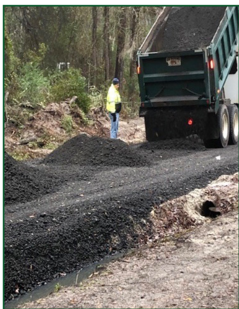
Side road construction

The structural renovation of this building is complete and now we have to focus on the interior decorations, some bedroom furniture, linens and towels; that are still in need. (4 Bedrooms) - another reason to come on Lions Day 2021 here at the camp. Come see the improvements, we’ve been busy.