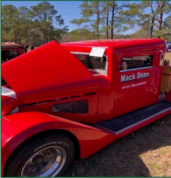
Truck from the car show

This was the fourth year in a row that these two clubs have organized this event. Funds raised are donated towards the camp programs, activities, and other needs to ensure our campers have a great time while attending summer camp.