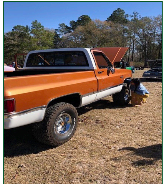
Truck from the car show