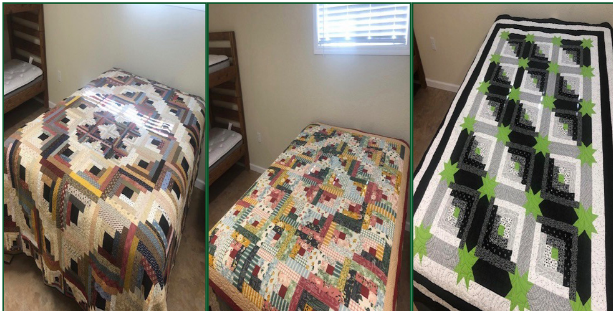
Handmade custom quilts from the Satilla Quilters of Woodbine, Georgia