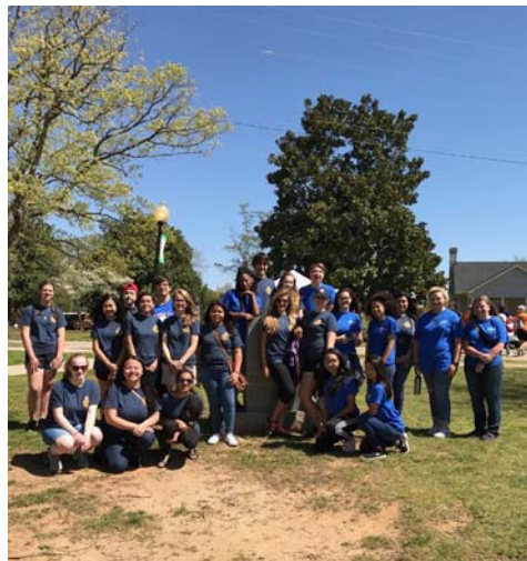
Byrnes Junior Civitan Special Olympics