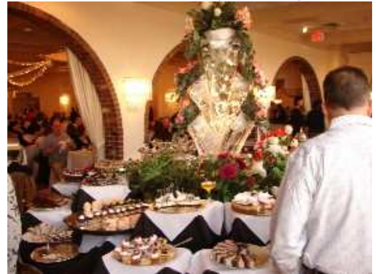
Dessert Table – only about 1/4 of it