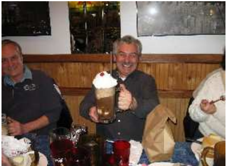
"small" Root Beer Float