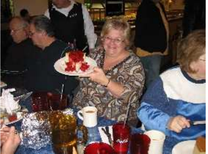
Did she eat the whole thing????