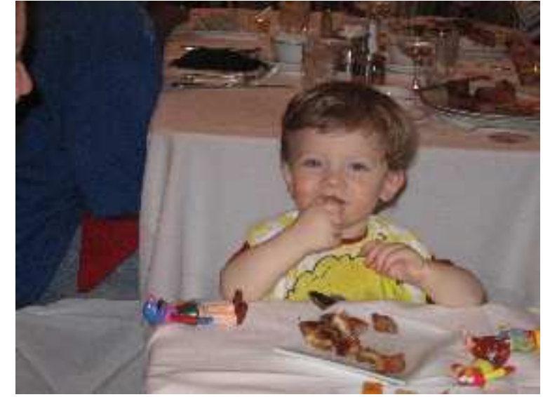
He looks happy