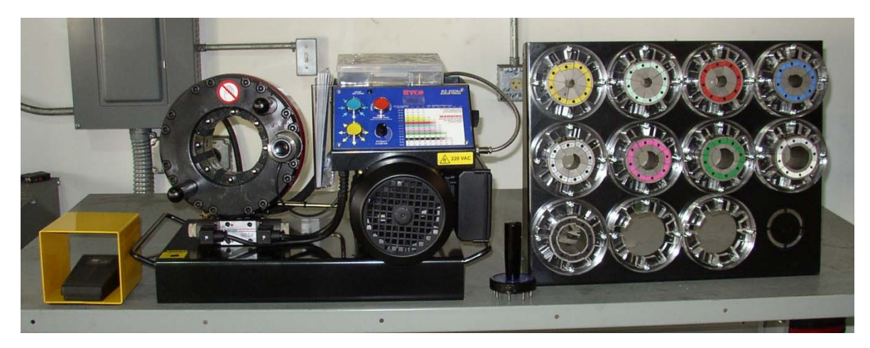
Custom Crimp CC4-50 340 ton capable of crimping up to 2-1/2" 6-wire hose 160 mm center opening (6.3")