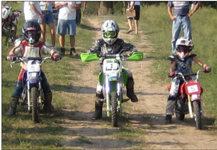
It's time for the start of the Pee Wee race.