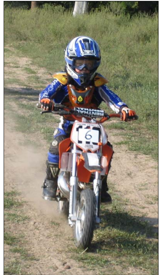
On Saturday, the Pee Wee event got everyone's attention. I'm not sure who all the riders were, but they sure had fun.

It was a very good, well-run event. Everyone I talked to had fun. Darn dust.