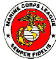
PHOTO RELEASE FORM

I hereby assign and grant to the Marine Corps League and the Scouts of America the right and permission to use and publish the photographs made of me this date by the Marine Corps League and/or the Scouts of America, and I hereby release the Marine Corps League and the Scouts of America from any and all liability from such use and publication, whether online or in print.