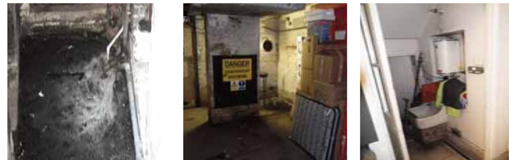
E X A M P L E S O F I T E M S T O B E I M P R O V E D

AND - allow correct & required coatings to all surfaces, probably two coats?