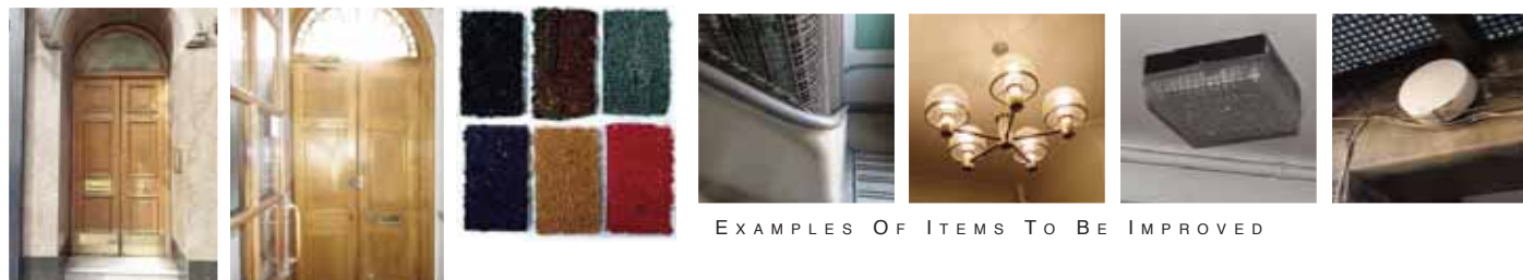
E X A M P L E S O F I T E M S T O B E I M P R O V E D

Hallway: ADD two new lights - replace other two Replace ALL Landing lights (6) with supplied units Replace Fire Escape Lights (4) with supplied units Add TWO Exterior Emergency Lights to wall Add ONE Electric Dual plug point on each floor (3) ALL lights supplied - ALL to have auto sensors and act as EMERGENCY LIGHTING