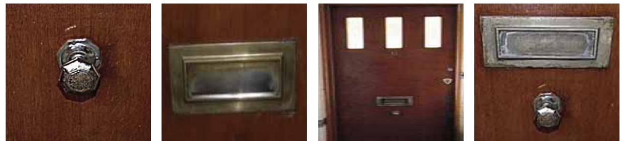
W H A T W E H A V E A T P R E S E N T

Rub down outside surface and re-varnish all 9 tenant front doors Remove & replace Door Furniture - door knob and letterbox (10") only with new brass fittings - can be supplied or follow our choice to source