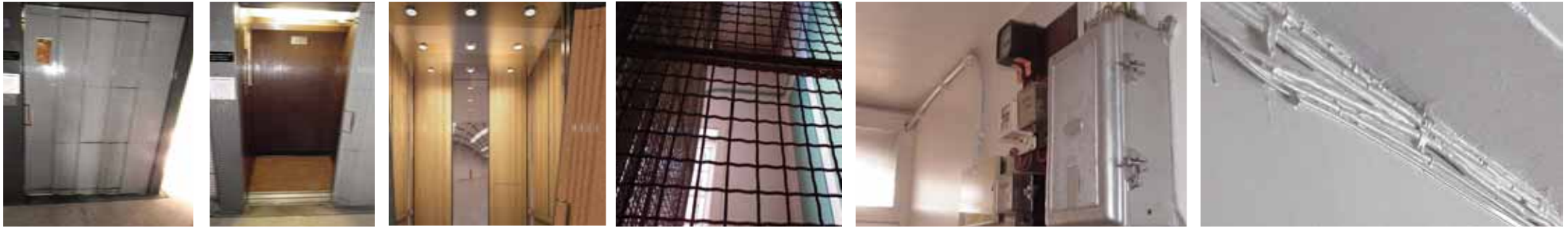
E X A M P L E S O F I T E M S T O B E I M P R O V E D