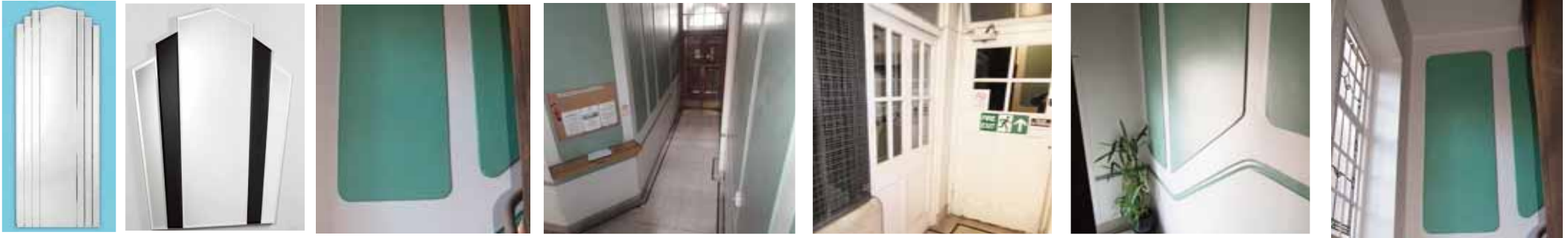
M I R R O R E X A M P L E S