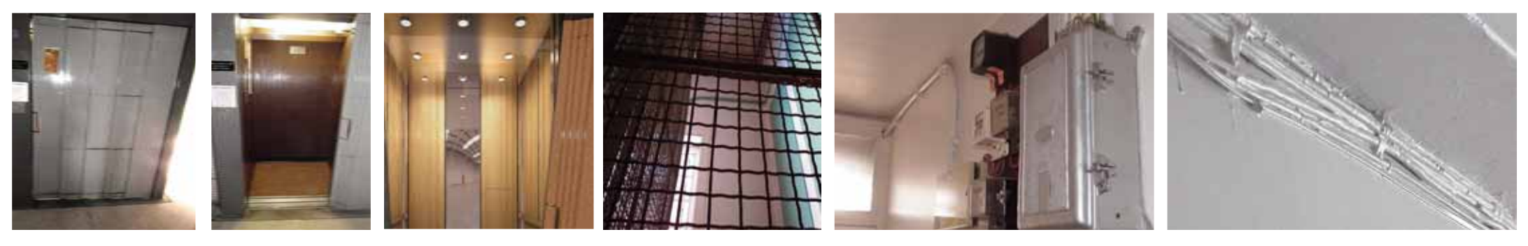
EXAMPLES OF ITEMS TO BE IMPROVED