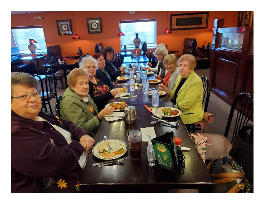
Mark your calendars. Ladies Lunch will be on April 27 . Currently, the location is undetermined. Suggestions for new locations have been made. We will discuss this at the March lunch.