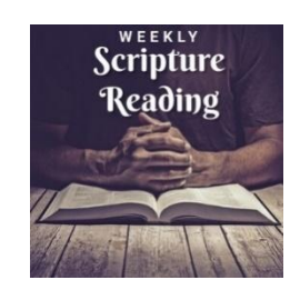
The Bible readings are from "Book of Common Worship"