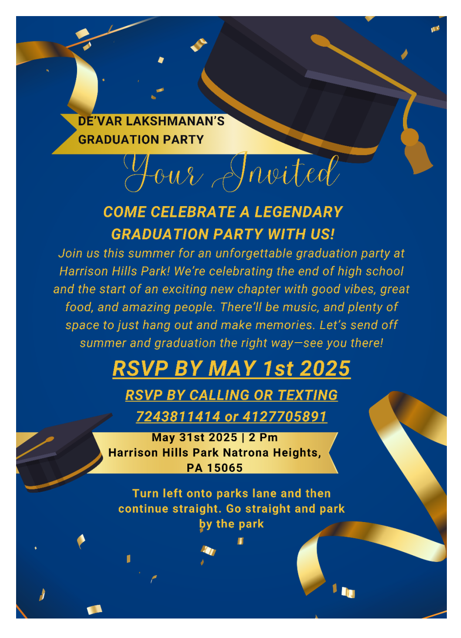
There is also an RSVP sign up sheet for this wonderful celebration of De'Var in the hallway!