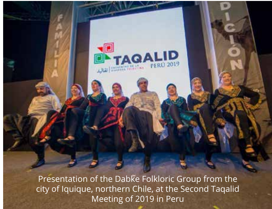
Presentation of the Dabke Folkloric Group from the city of Iquique, northern Chile, at the Second Taqalid Meeting of 2019 in Peru

For this reason, we are also aware of the need for unity among our people and the need to act jointly. Recently, we have been generating links with other communities in the Diaspora. A few years ago, in the Palestinian Club of Santiago, we organized a convention, «Taqalid» (traditions), to bring together the Palestinian communities of Latin America around the Palestinian culture and identity. Thousands of people from different Latin American countries arrived in Santiago in 2017 and to Lima, Peru, in 2019. Both gatherings were very successful. Ours is a process that seeks to reactivate other communities, get to know each other, and insist that the Palestinian Diaspora must play an important role, not only sharing information about what happens in Palestine and as a supporter of the culture, but also as active members of the Palestinian community—a decision maker. We are part of the Palestinian people. We must participate in their decisions.