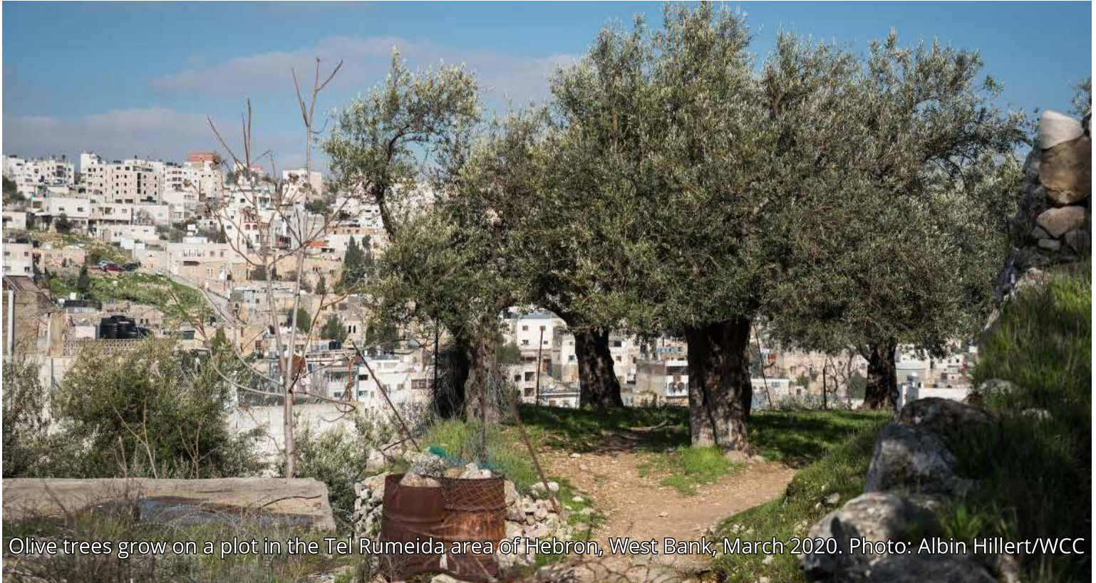
Olive trees grow on a plot in the Tel Rumeida area of Hebron, West Bank, March 2020.