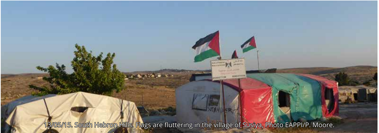
13/05/15. South Hebron Hills. Flags are fluttering in the village of Susiya, Photo EAPPI/P. Moore.

We have been living in this area since before 1948 and have the evidence to prove it. Our families were kicked out of their original homes because Israel claimed we were living on an archaeological site. A few years later my family was removed again when the Israeli authorities loaded everyone on trucks and