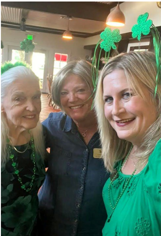
Soiree Round Table went with a St. Patrick's Day theme for their March Meeting. They met at The Cottage Irish Pub, played St. Paddy Bingo, enjoyed great food, and each other's company.