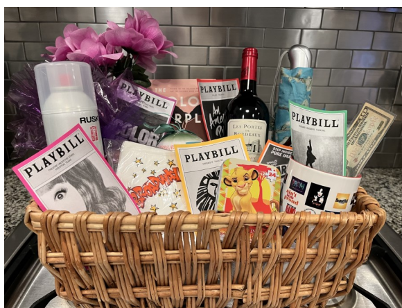
The basket SIGP members put together to bring and raffle off at the Spring Conference.

More Spring Conference photos on next page