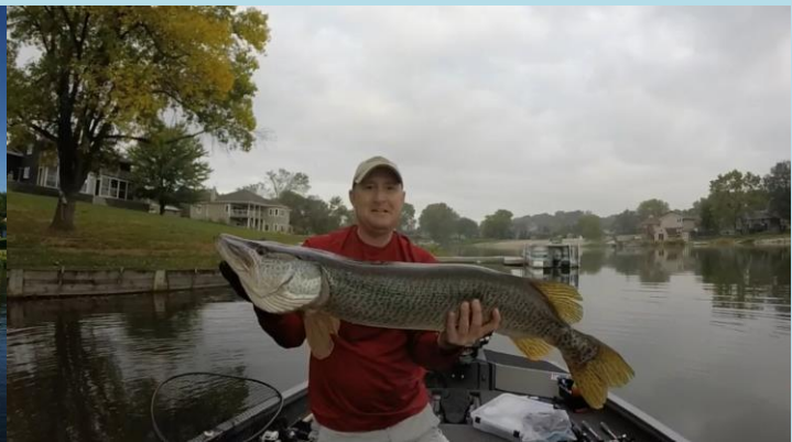
Tiger Musky from October 2021 (40 Inches)