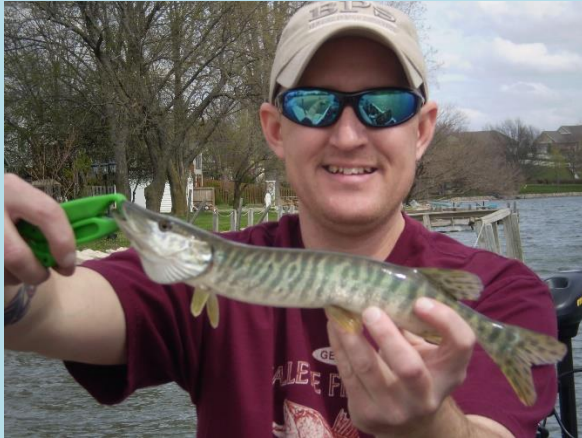
Tiger Musky from April 2016 (13 ½ Inches)

up in shallow water to feed and will hit jerkbaits, crankbaits, and swimbaits. These fish can reach 15+ lbs. (30+inches) in Nebraska waters! Catch and release is strongly encouraged for larger fish!