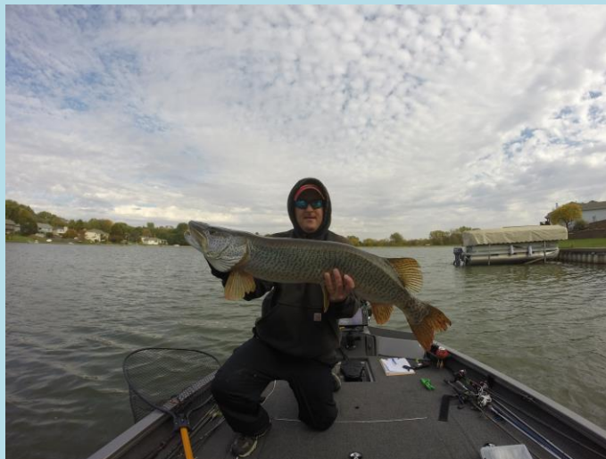
Tiger Musky from October 2021 (41 Inches)