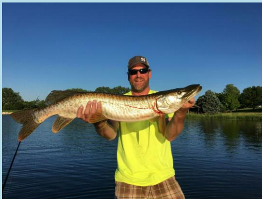
Tiger Musky from June 2019 (37 Inches)