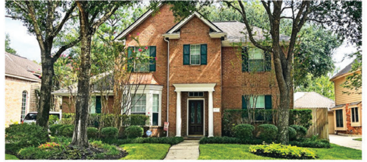
Section 2 | 9115 Rhapsody Lane