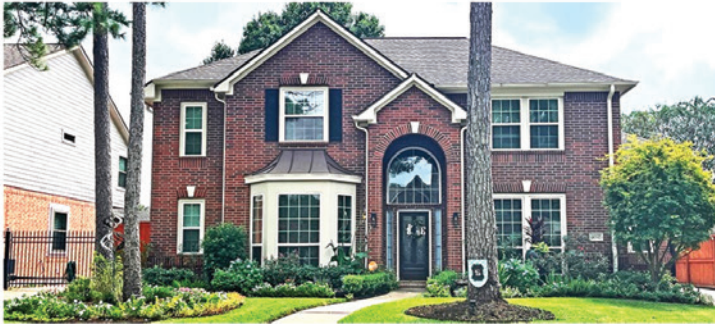
Section 3 | 8711 Serenade Lane