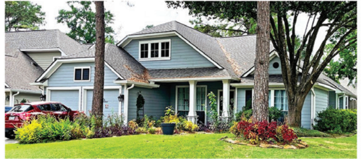
Section 4 | 9315 Sinfonia Drive