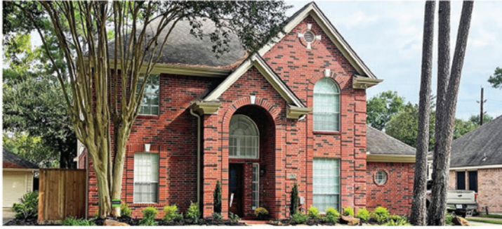
Section 1 | 9206 Symphonic Lane