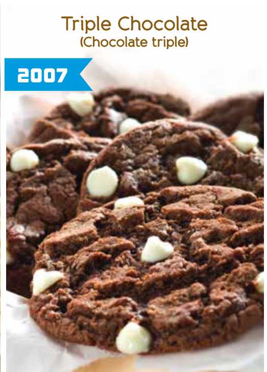
Triple Chocolate (Chocolate triple)