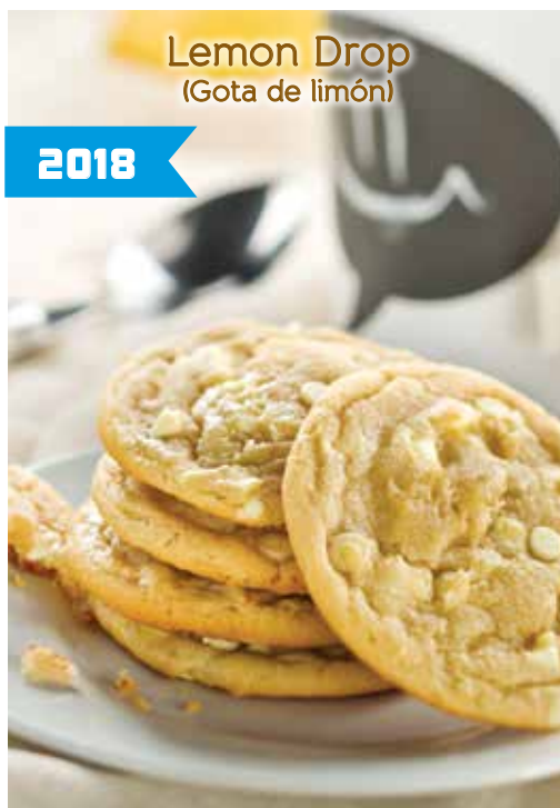
Lemon Drop (Gota de limón)