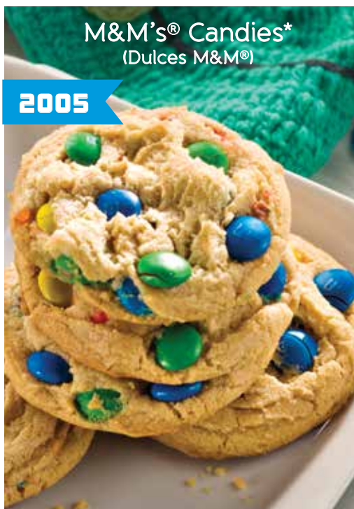
M&M's® Candies* (Dulces M&M®)