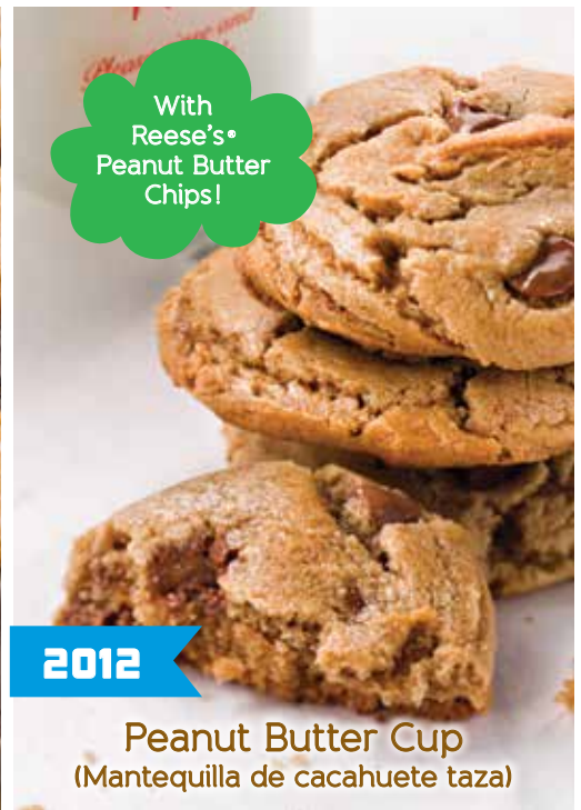
Peanut Butter (Mantequilla de cacahuete)