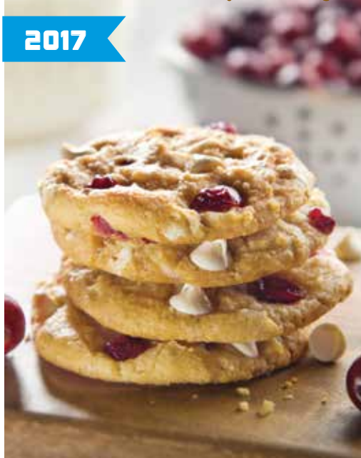
White Chocolate Macadamia (Chocolate blanco con macadamia)