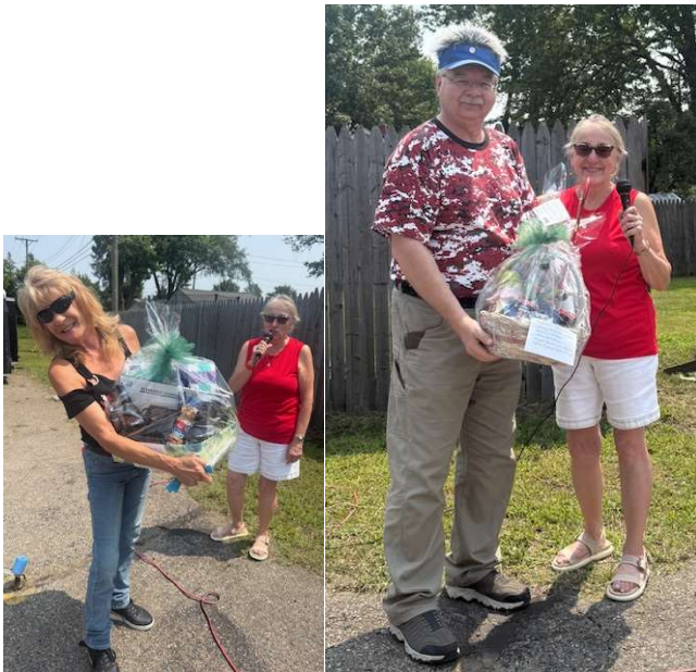
Basket Raffle Winners