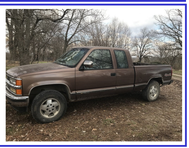
1994 Chevy Silverado ext cab, 4x4 V-8, 4 spd, only 79,376 miles, good cond!

2009 Buick Lacrosse, 4 door, only 72,833 miles, white, sharp