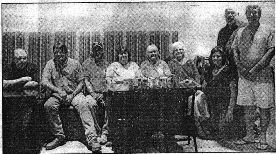
The Little Closet Food Pantry volunteers at Tips for Tuscaloosa.