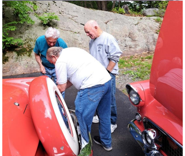
Three guys to change one light bulb? Note- there was four Additional pics on the web site