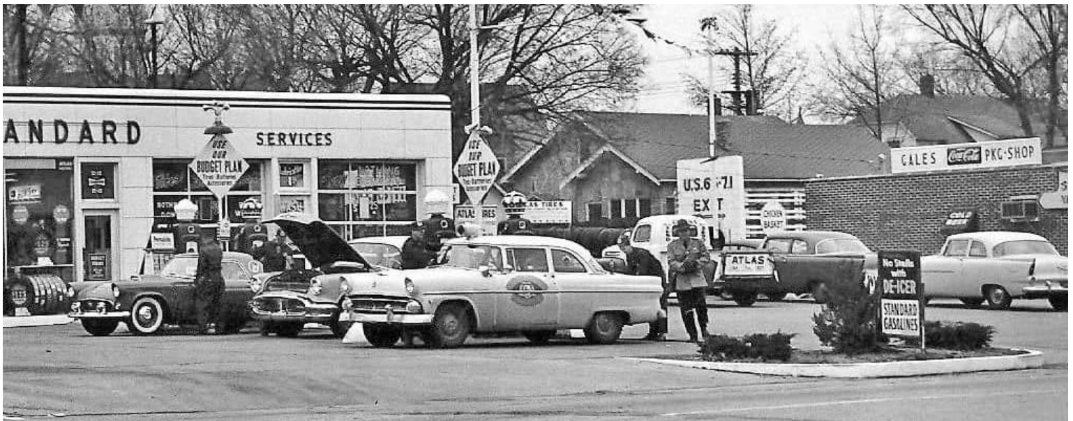
Mid to late 55 scene- all three major auto co's represented