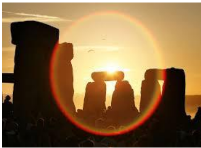
Summer Soltice - longest daylight of the year June 20th

You burn more calories sleeping than watching television - nap anyone ?