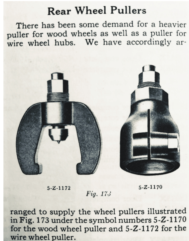
ranged to supply the wheel pullers illustrated in Fig. 173 under the symbol numbers 5-Z-1170 for the wood wheel puller and 5-Z-1172 for the wire wheel puller.

Many owners, being resourceful, find making garage tools for the Ford a fun pastime. Your Tech Editor has successfully modified, and uses, a modern cast steel pitman arm puller, found at many auto parts stores for under $20.