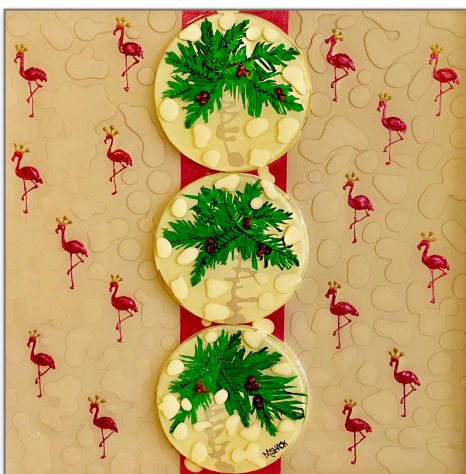
Flamingos & Coconuts

I've had a longtime relationship with "The City", and its pull on me is unmistakable. Back before I became a professional artist, I worked as a consultant and regularly came to New York on business. I spent every possible moment that I wasn't "on-the-clock" taking in everything that the city offered. The sights, the sounds, the food, and of course, the art.