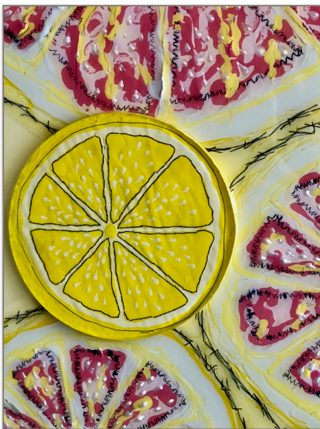
Sew Many Lemons

481 Van Brunt St. Door 7, Red Hook, Brooklyn, New York