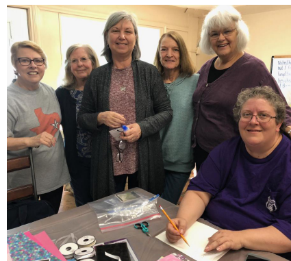
Residents and volunteers handcrafting beautiful cards

Volunteers and residents are handcrafting beautiful note cards. This time together gives the residents and volunteers a creative outlet as they fellowship and encourage one another. Funds raised will purchase clothing, athletic shoes and basic necessities for new residents who are entering the recovery program from prison. Packages of four Celebrating Second Chances cards are $20, and will be sold at Oaks events, local specialty stores, and bazaars.