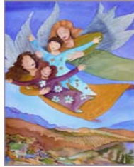
Angels Among Us

U.S. Department of Health & Human Services, Substance Abuse & Mental Health Services Administration www.samhsa.gov , (877) 726-4272