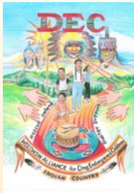
DEC in Indian Country