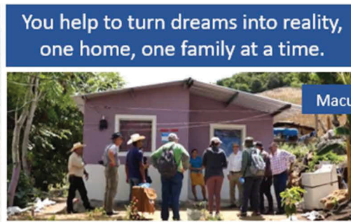
You help to turn dreams into reality, one home, one family at a time.