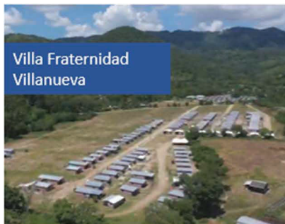
Villa Fraternidad Villanueva

Your contribution can not only move a family like this into a new, sturdy, sanitary home, but also put them on a more dignified path full of new opportunities