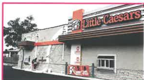
Little Caesars Mural