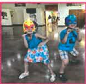
June First Friday