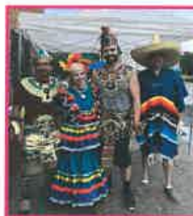
Muddy Mini 1/2 Marathon