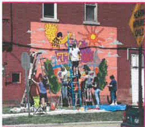
Community Mural 2018