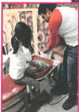
Children's Pottery Class