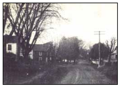
Early 20th century Thank you to these dedicated volunteers Delaware identifies this road as Maryland Ave., Kemblesville PA. We now call this road Appleton Road.

One of the goals of the Historical Commission is to start an oral