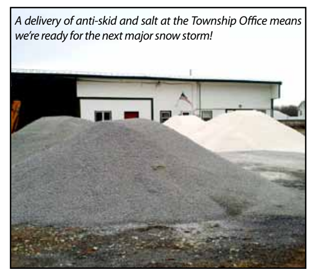
In this issue learn about the Township roads and maintenance program, the problems with septic system additives, plus meet our new supervisors.