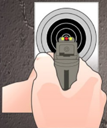
AIMING DURING RESPIRATORY PAUSE

Hold your breath while pulling the trigger. As you are exhaling, let about half of the air out of your lungs, aim and pull the trigger. Holding your breath is known as a respiratory pause and it will help you with your hold control.