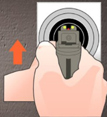
SIGHT PICTURE WHILE INHALING