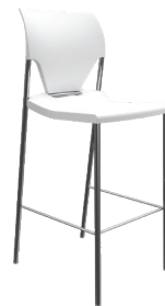
AV-8 A : 16" C : 30" E : 15"