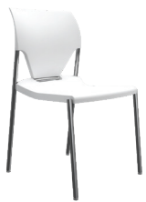
AV-4 A : 16" C : 18" E : 15"