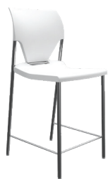
AV-7 A : 16" C : 24" E : 15"