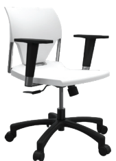
AV-L A : 16" C : 17" - 22" E : 15"