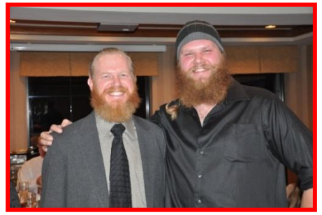
The "Beard Boyz" ©