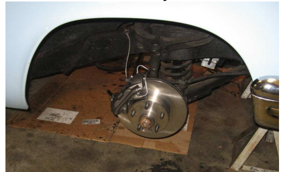
One side done