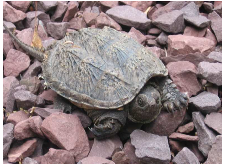
Life in the country – a visitor