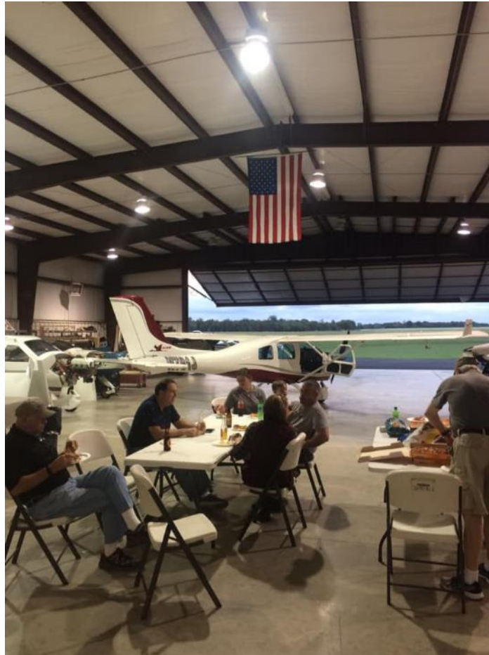
Having a Meal with Friends