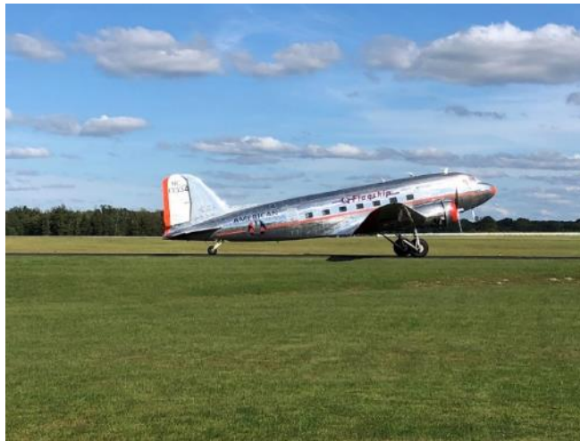
A DC-3 in American Airlines Livery

The picture above was taken at the Lightning Homecoming. This DC-3 is based there in Shelbyville, I think. It took off and when it came back for a landing, I got this picture as it was taxiing by. A beautiful plane. One day, I want to get a ride on one.