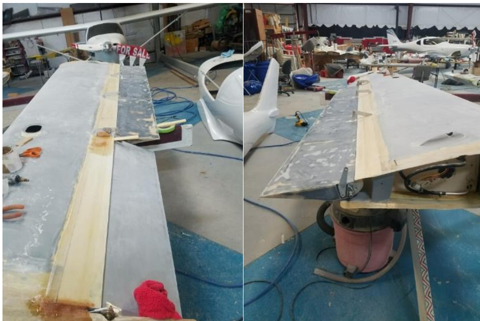
Flap and Aileron Installed