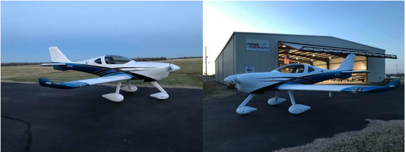
An XS That Was Built a Few Years Ago in for Maintenance