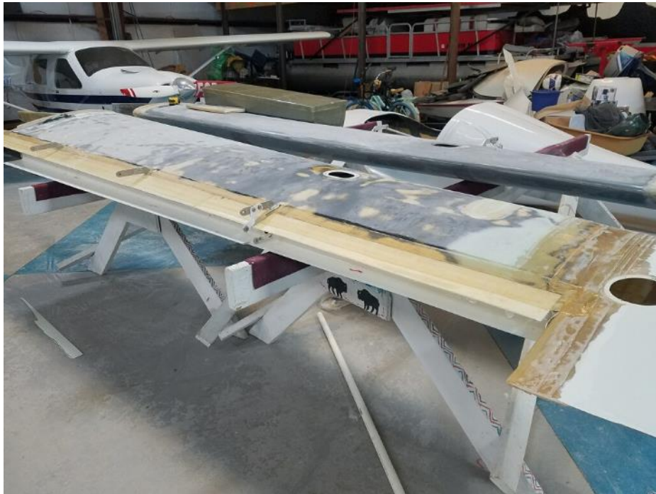
Wing Flap and Aileron Gap Seals in Place

I got some interesting pictures from Greg Hobbs yesterday (on his 50 th Wedding Anniversary to Crystal. Happy 50 th you two!!!). Greg has been working on gap seals for the Lightning. They are fiberglass layups that run the length of the wing. The pictures below show them on the wing. The top picture is the wing with the seals. The flap and aileron have not been installed. You can see that this is the bottom of the wing with the wing root to the left and the wing extension on the right already glassed on. The two pictures on the bottom of the page show the flap and aileron installed. On the left, the aileron is towards you, on the right the flap is towards you.