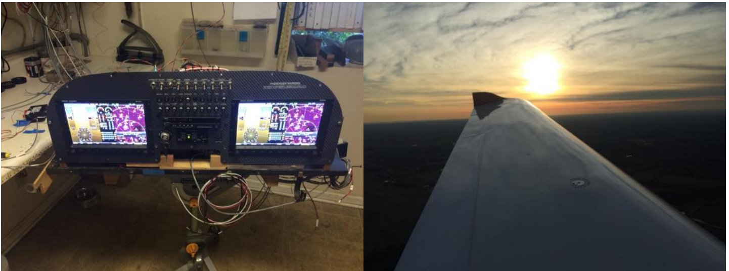
The Demonstrator's Panel and a Beautiful Sunset Flight

Above is one of the pictures from the Homecoming. I really like these evening shots with the Hangar full of airplanes. The flag is hung properly and I think it is really pretty. But then, I'm an airplane nut. Certifiable crazy about airplanes. Just ask anyone.