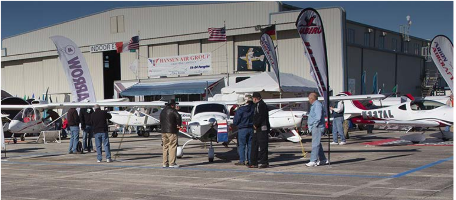
US Sport Aviation Expo - Sebring, FL Airport Identifier - KSEF

US Sport Aviation Expo January 23 – 26, 2019