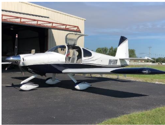
An RV-10 That Was Built at Arion