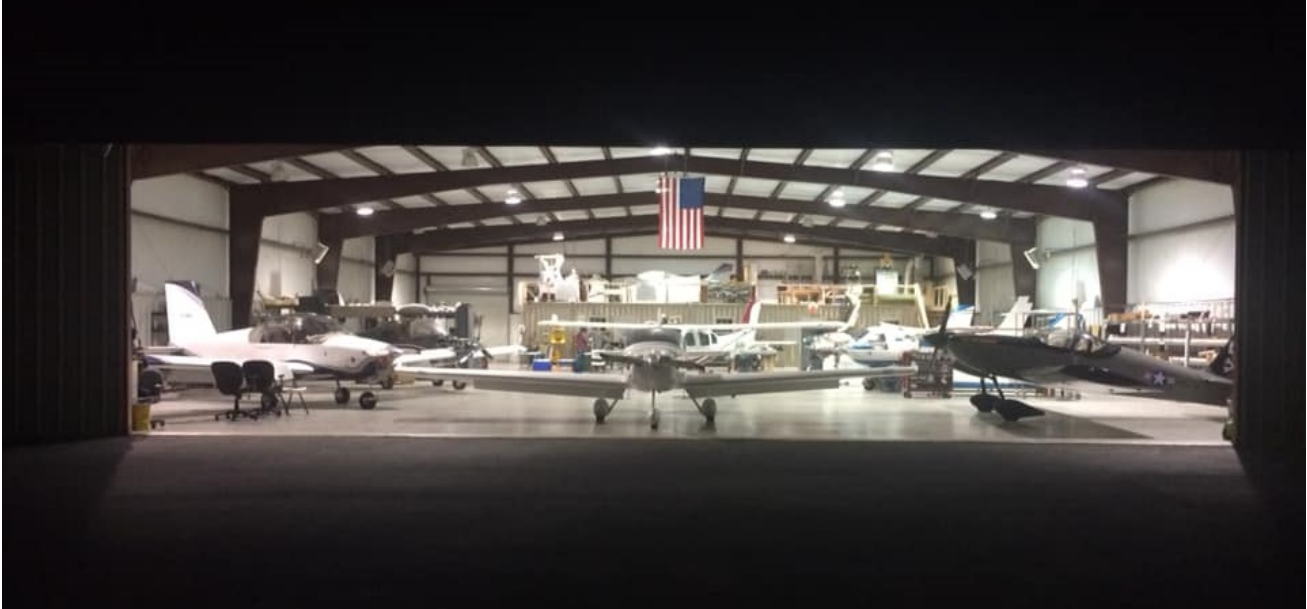
I Just Love These Shots of the Arion Hangar