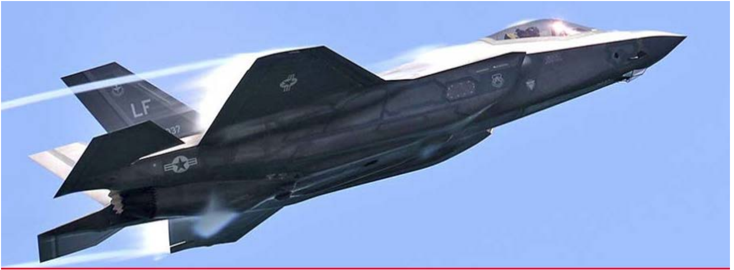
Melbourne Air and Space Show Airport Identifier (KMLB)