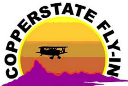
Buckeye Municipal Airport - KBXK