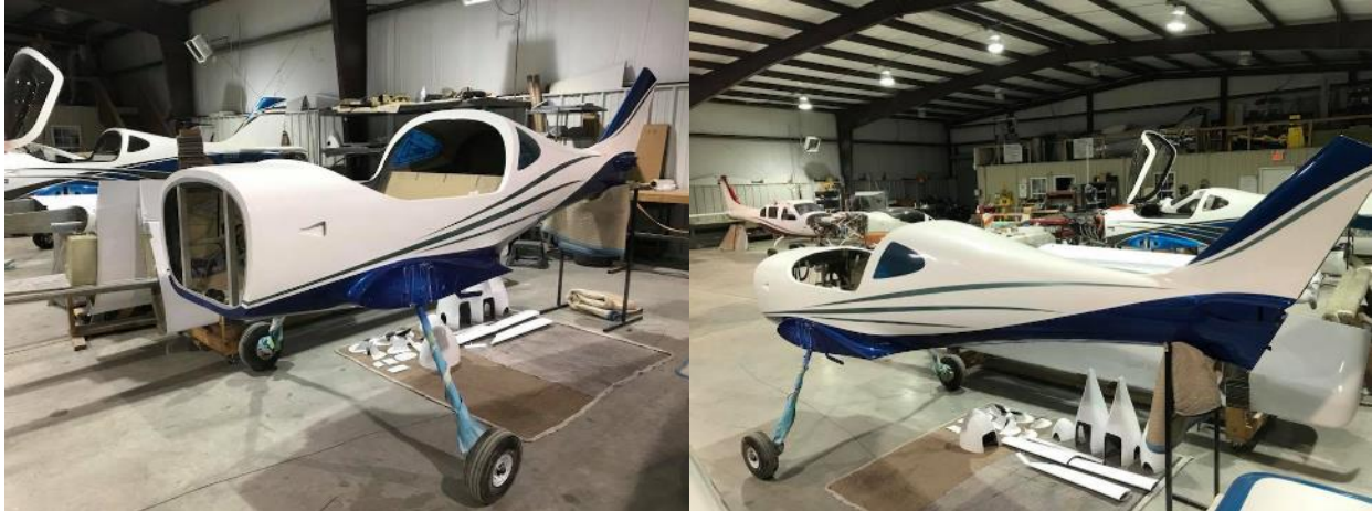
Ted's Lightning Back from Paint - Beautiful

Below are two more pictures after his plane got back from the paint shop. Another beautiful Lightning getting built. In the background you can see the Demonstrator almost finished.