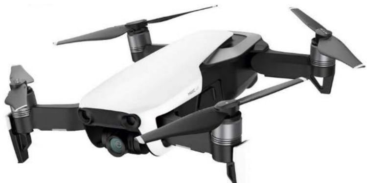
On the way back from breakfast at Fort Pierce and our Mavic Air