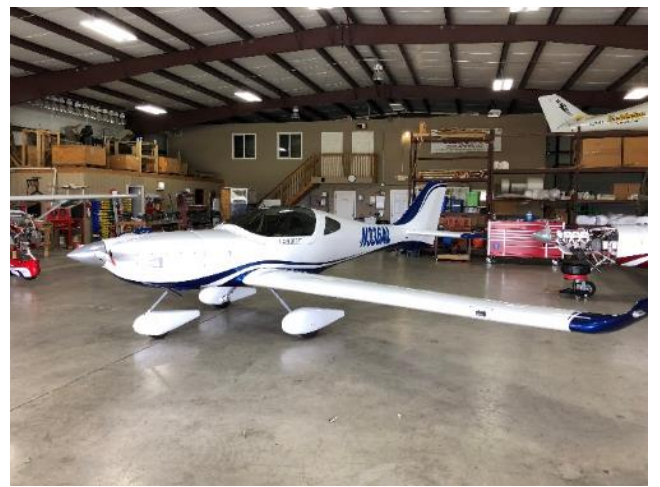
LS-1 at the Factory for the Mk-2 Tail