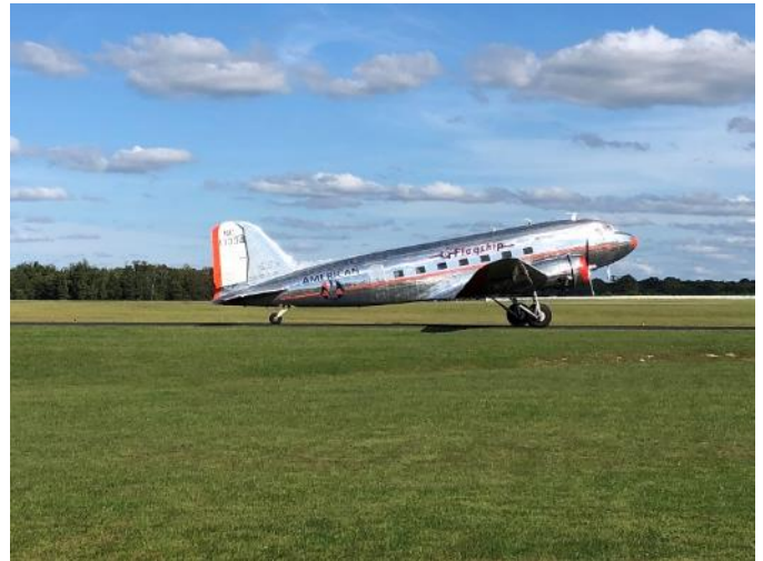
A DC-3 Taxiing By