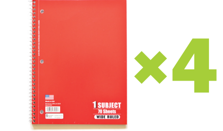
Four 70-sheet notebooks of wide- or college-ruled paper, approximately 8" x 10<sup>1</sup>/<sub>2</sub>"; no loose-leaf paper