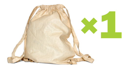
One sturdy drawstring backpackstyle cloth bag, approximately 14" x 17", with shoulder straps (no standard backpacks)