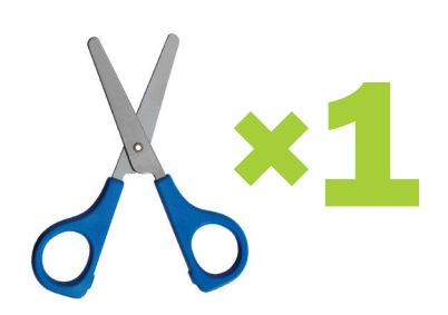
One pair of blunt scissors (safety scissors with embedded steel blades work well)