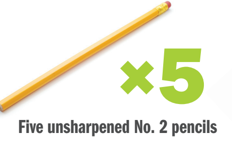
with erasers; secure together with a rubber band