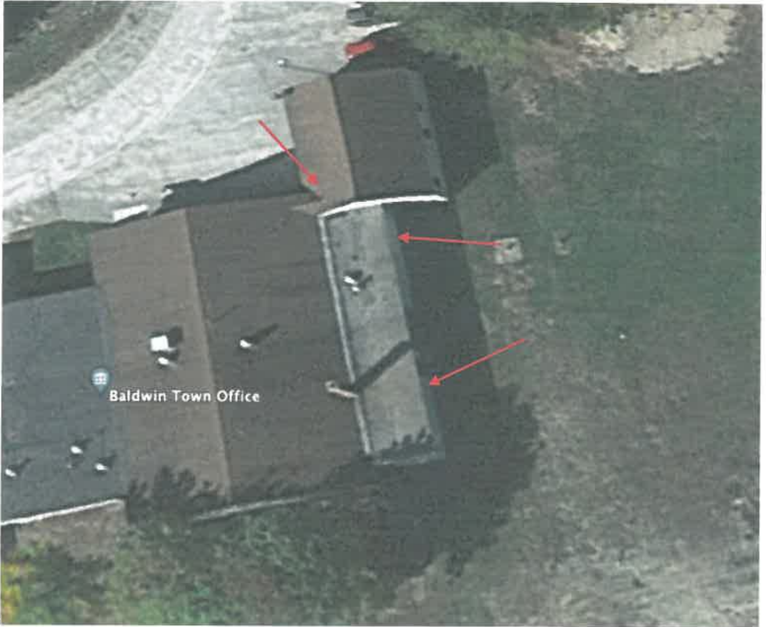
Baldwin Town Office