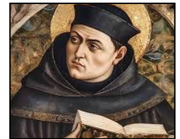
Feast Day: January 28

Sources: catholic.org and franciscanmedia.org