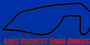
LAKE GARNETT ROAD COURSE