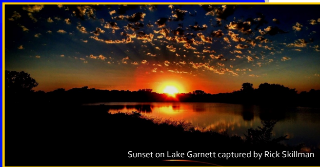
Sunset on Lake Garnett