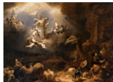
Angels at Jesus Birth