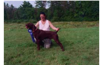
INTERMEDIATE LEVEL "SPENCER" BEAR MT BLUE RIDGE ECLIPSE, JH C/O - B DESJARDINS B/O/H - D BROAD