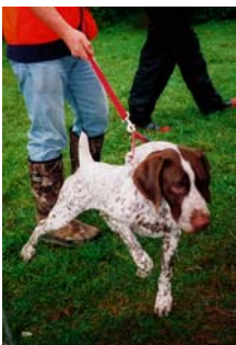
Scout Mosher anxious for his turn at the birds! (6 months old)