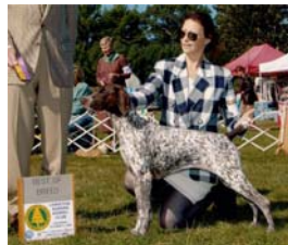
Best Of Breed - Ch Roscommons Sports Edition, JH