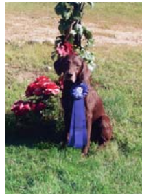
VETERAN INTERMEDIATE LEVEL 1ST CH Bear Mt Blue Ridge Paradox, JH B/O/H - D BROAD "KERRY"