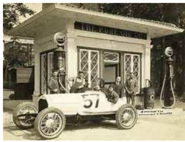
Fill er up

Desert sky blue. Black and white interior, 2 tops, 44,000 miles. Asking 16,500. Open for offers. JOHN MOORE 201-998-3559 NORTH ARLINGTON