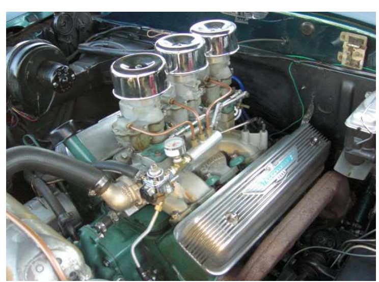
How about a set of these for your Tbird??