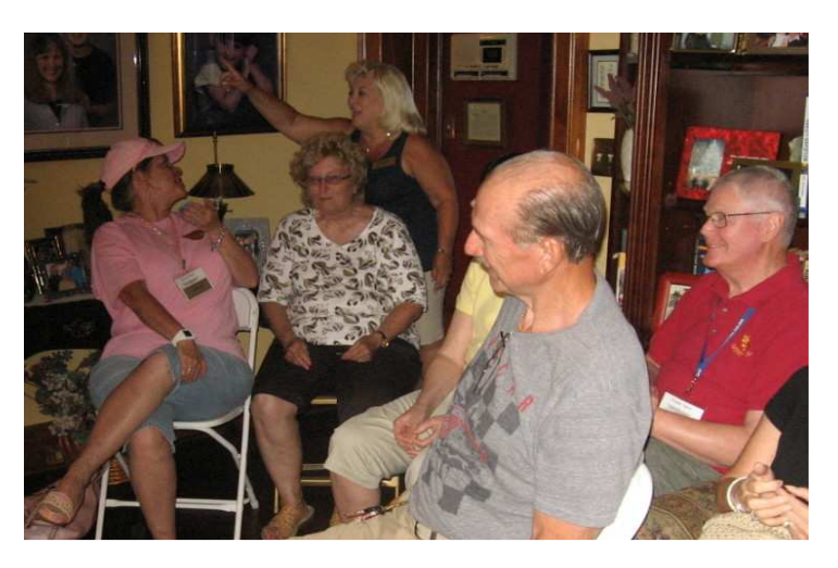
August 14 is VJ Day - the end of WWII