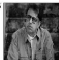
ANANTH NARAYAN MAHADEVAN

Anant Mahadevan directed many movies in his career. Knocker film won National Award for the year 2021. Some of his best works are Gough Book , Aksar 2 (2017), Gour Hari Dastaan (2015), The Xpose (2014), Life's Good, Staying Alive (2012), Mee Sindhutai Sapkal (Marathi) (2010), Red Alert: The War Within (2009), Aksar (2006). And he also worked as a writer for some films. At present Anant Mahadevan is known as a renowned actor, director and a writer in the Marathi and Hindi film Industry as well as in Tamil industry also.