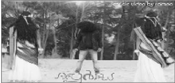
SPARDHA Music Video/ 7:55/ Malayalam/ Kerala, India

It shows the story of an artist. He was a dreamer of becoming an artist. But its courses charge Heavy fees. His conscious and subconscious mind are in conflict. His conscious mind thinks. but his subconscious mind totally needs freedom to unleash his ideas and Manifest the Minto reality. He converts his mind to be the god of small things and decides to be The pilot of his life. He starts a found object (discarded objects and objects collected from the surroundings) class. Going to bus stand puts notices all alone. Along with school children makes beautiful art sculptures from found objects. Thus can convert the polluted earth into colorful world.