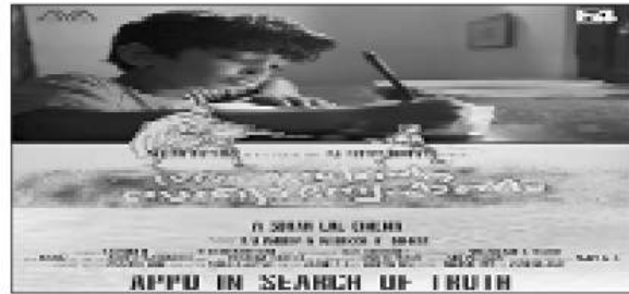
APPU IN SEARCH OF TRUTH Feature Film/ 01:45:28/ Malayalam/ Kerala, India