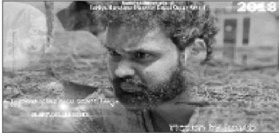
DIAMOND IN THE ROUGH Short Film/ 3:48/Malayalam/ Kerala, India

It shows the story of an artist. He was a dreamer of becoming an artist. But its courses charge Heavy fees. His conscious and subconscious mind are in conflict. His conscious mind thinks. but his subconscious mind totally needs freedom to unleash his ideas and Manifest the Minto reality. He converts his mind to be the god of small things and decides to be The pilot of his life. He starts a found object (discarded objects and objects collected from the surroundings) class. Going to bus stand puts notices all alone. Along with school children makes beautiful art sculptures from found objects. Thus can convert the polluted earth into colorful world.