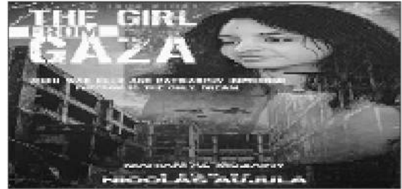
THE GIRL FROM GAZA Documentary Short/ 20:00/ English/ Jordan & UK