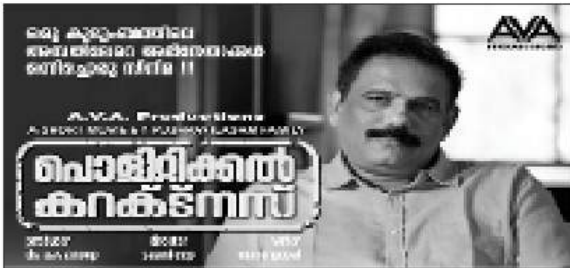
POLITICAL CORRECTNESS Short Fiction/ 28:08/ Malayalam, Chennai, India

Ram Mohan Thampy, Municipal counselors with a strong follower base and popularity gets a boost in his political career, when his son 14 year old son, Abhijith Thampy receives National Bravery Award. The award is for his bravery act of saving a 10 year old child from drowning in a deep river. Abhijith ignoring his own life had jumped into the river and got the child back to her life.