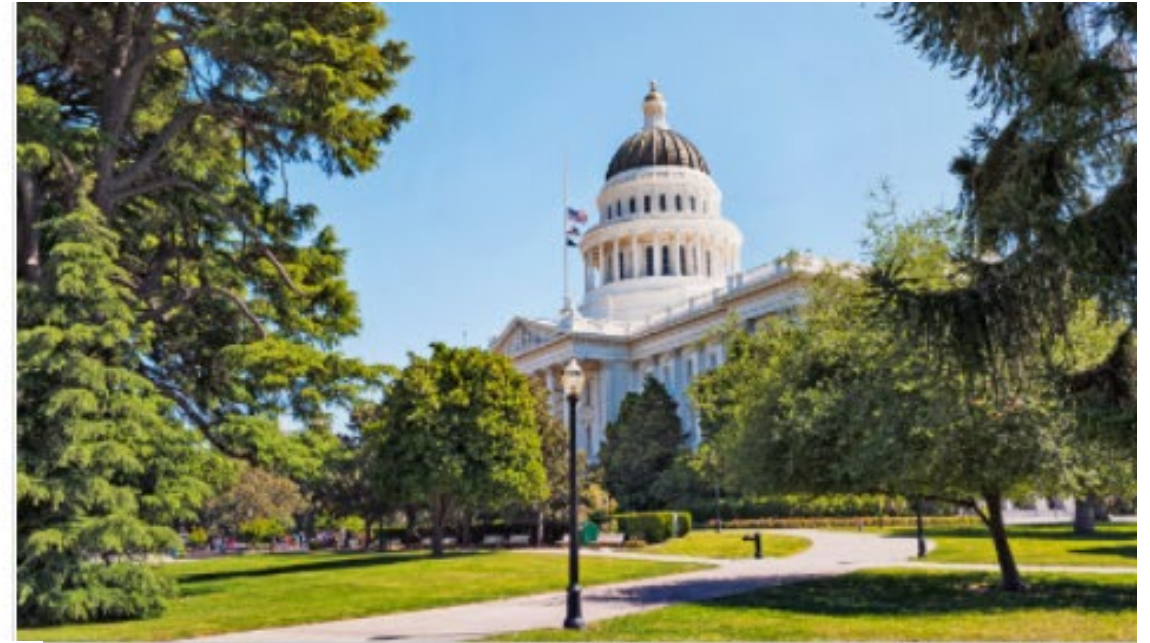
California Public Policy