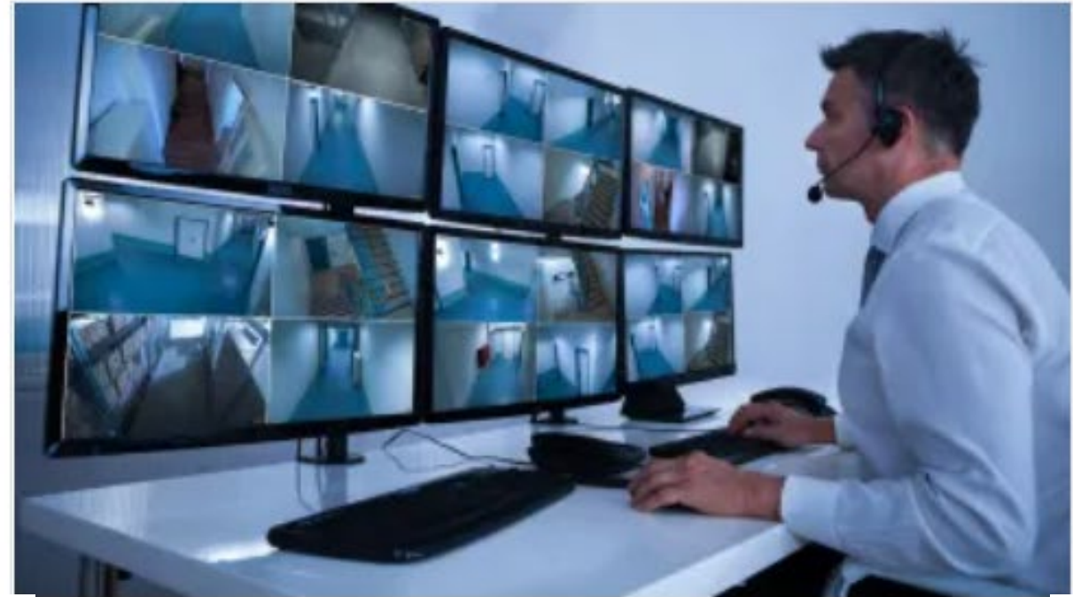
How to Conduct an Investigation