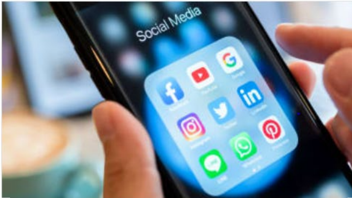
How to Use Social Media for Applicant Screening