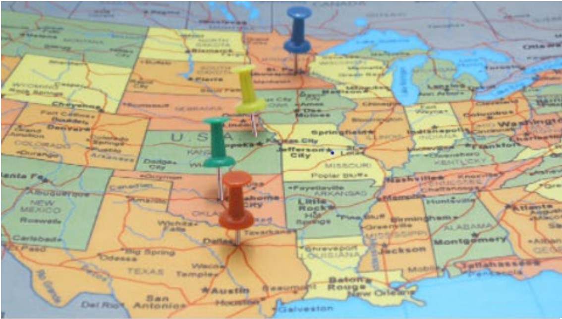
State Legislative Tracking