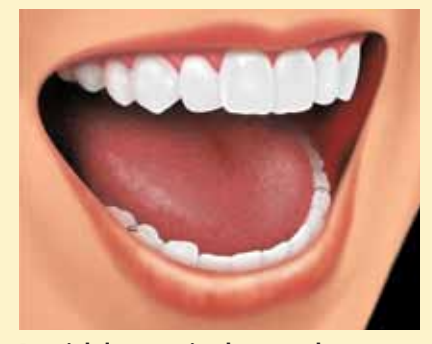
Partial denture in the mouth (showing clasps)