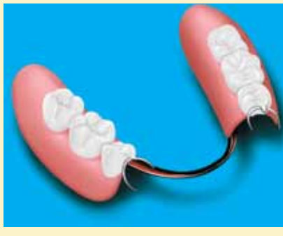
Partial denture outside of mouth

Sometimes your dentist may also recommend crowns, or "caps," on your natural teeth. Crowns may improve the way a removable partial denture fits your mouth. Ask your dentist which kind of removable partial denture is right for you.