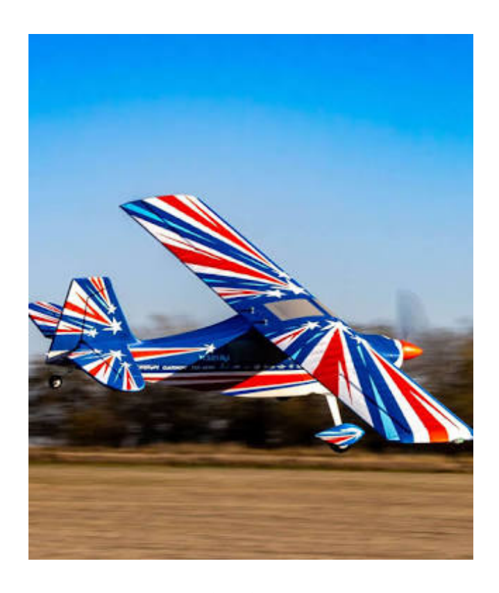
Happy July 4th!!!