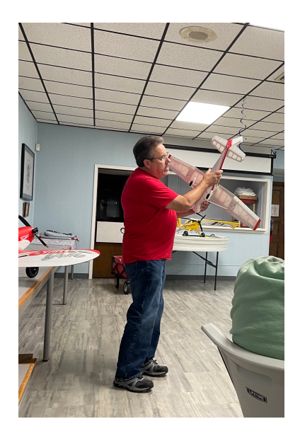
The E-Flite Aerobat 150/250

-Model Building Hints and Tips: If you can't find the exact prop nut, hardware stores have a nut with a nylon insert or nyloc nut, these work very well.