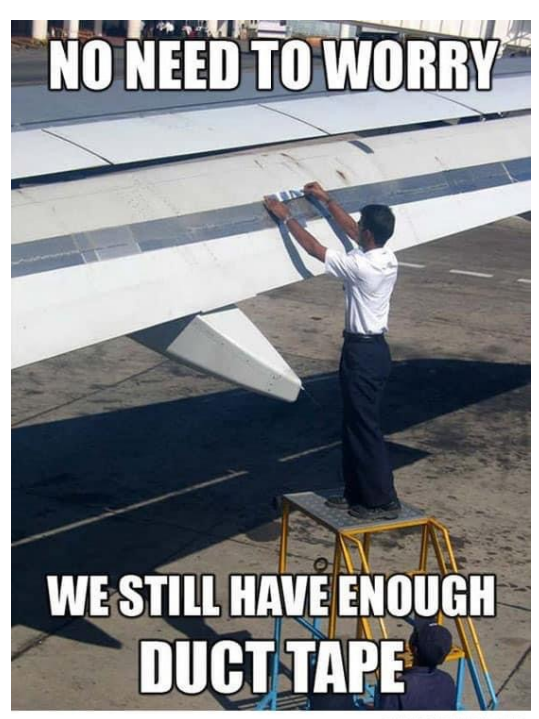
more funny stuff at FUNNYASDUCK.NE