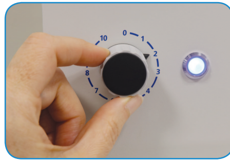
Variable speed control knob