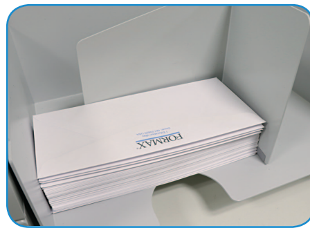
Adjustable outfeed tray accommodates a wide variety of envelope sizes, keeping them neatly stacked after sealing