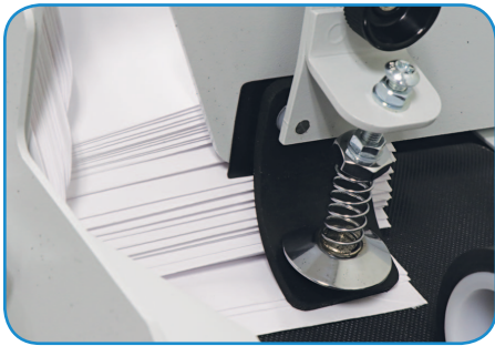
Envelope separator ensures single feeding

Rugged Construction: Heavy-duty steel body for durability