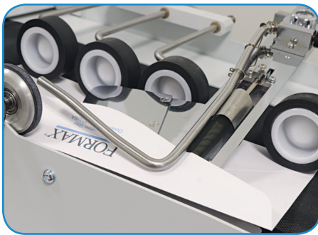
Precision moistening roller and flap closing bar accurately seal stacked or nested envelopes in a single pass